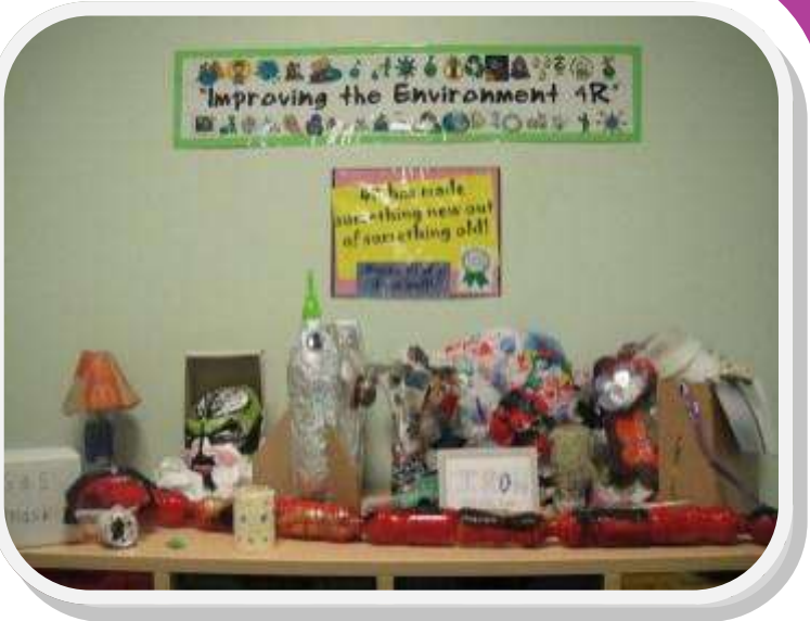
photo of children's efforts.