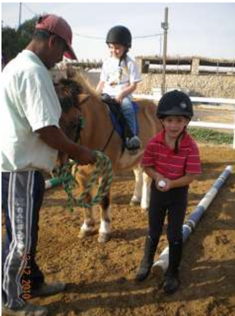
Getting ready for the egg and spoon.