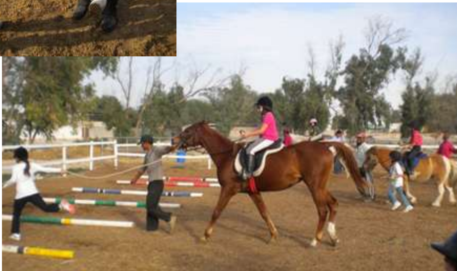
Race for the finish line!