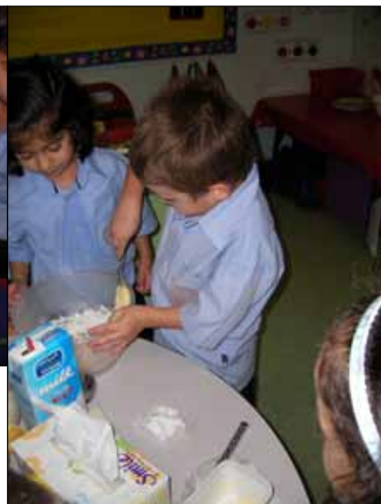
The Reception children have settled into their new classes and have been busy with lots of fun activities, also making new friends.