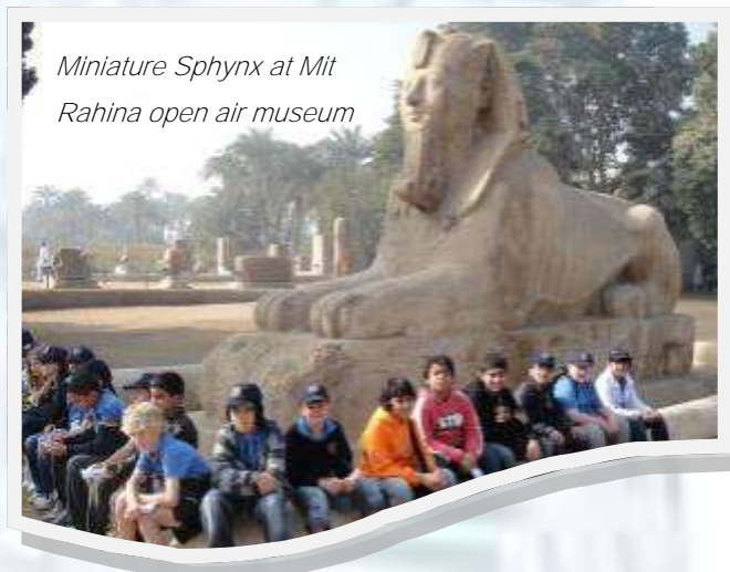
Miniature Sphynx at Mit Rahina open air museum