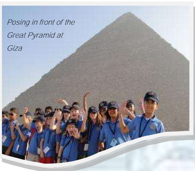
Posing in front of the Great Pyramid at Giza

On December 2, 2010, a group of Years 5, 6 and 7 children flew to Cairo on a five day trip, designed to enhance their school studies of ancient Egypt.