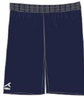
MULTISPORT LONG LENGTH SHORT Navy/Navy