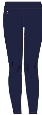
SPORT LEGGING Navy ASL-NVY