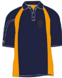
SECTOR POLO Navy/Amber EEPB