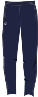
PRO TRACK PANT Navy/Navy PTP-NVY