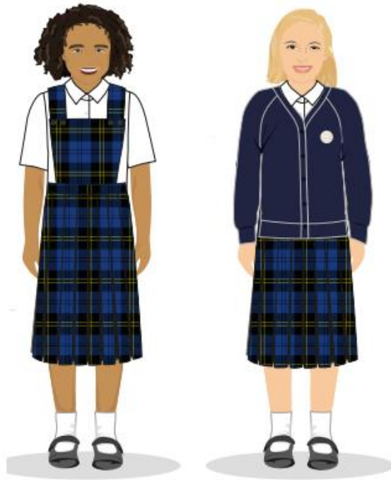
Examples of EYFS & Key Stage 1 Daywear