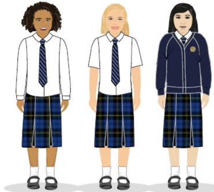
Examples of Key Stage 2 Daywear